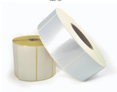
热敏纸 / 合成介质